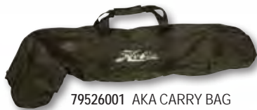
79526001 AKA CARRY BAG

88991311 MAST CAP 79511021 MAST OLDER SWIVEL TIP