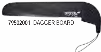
79502001 DAGGER BOARD

79520001 AKA V1 (L/R) FWD 79512201 AKA V2 (R) FWD