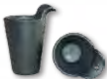
72012001 SCUPPER PLUG (Quest / Kona / Outback)