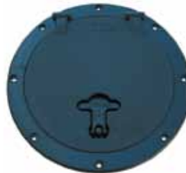
71702011 HATCH 8" TWIST AND SEAL 71702001 HATCH 8" TWIST AND SEAL RETRO KIT 71331001 FLANGE GASKET / 71702021 LID O-RING 8031131 SCREW