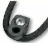
78510001 BUNGEE HOOK 8031961 SCREW