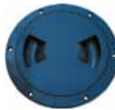
71130001 HATCH 5" SCREW-IN 8031501 SCREW