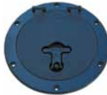
71701011 HATCH 6" TWIST AND SEAL 71701001 HATCH 6" TWIST AND SEAL RETRO KIT 71321001 FLANGE GASKET / 71701021 LID O-RING 8031131 SCREW